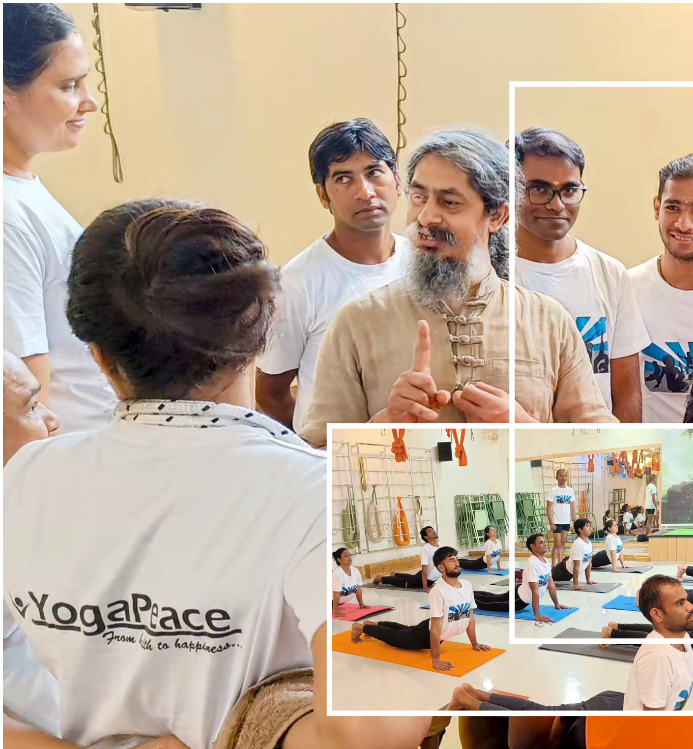
Yoga Teacher Training Sessions at YogaPeace